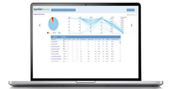
QUANTIDEX ® NGS REPORTER

The kit, interrogates 46 gene regions (amplicons) within 21 genes, with high clinical* significance in various human cancers. The scope of variants reported by the panel include >1,600 known COSMIC variants, including single nucleotide variants (SNVs) and insertions-deletions (indels) targeted by the panel. The kit includes all reagents for pre-analytical DNA QC/quantification, gene specific PCR, library purification and quantification for sequencing with Illumina chemistry.