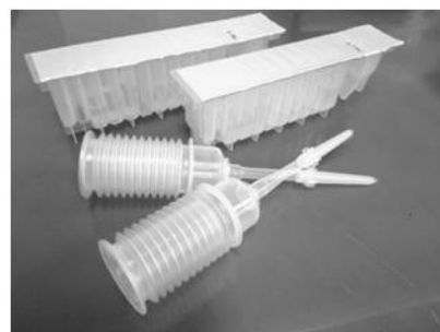
Fig. 2: Back: MagDEA Dx LV cartridges for nucleic acid purification on the magLEAD 5bL. Front: Bellows tips with single-use piercing unit.

The optimized protocol uses magnetic bead-based chemistry to rapidly extract and purify high quality nucleic acids with excellent reproducibility. No additional reagents are required. Each cartridge is labeled with a 2D barcode for reagent tracking. The unique bellows tips are completely sealed to prevent contamination when potentially infectious samples are processed.