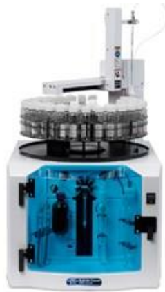
Figura 1: Modelo Fusión Analizador TOC UV/Persulfate

El presente trabajo muestra que el Modelo Fusión de Teledyne Tekmar, es un Analizador de TOC basado en oxidación UV/Persulfato (Figura 1) que cumple fácilmente con la capacidad y requerimientos (IDC) Método USEPA 415.3.