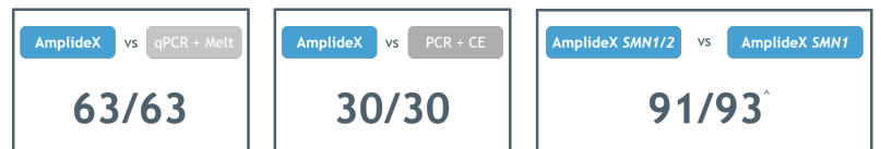
Figure 4. Excellent concordance of results between AmplideX and other methods in well-characterized clinical samples.

* For Research Use Only. Not for use in Diagnostic procedures.