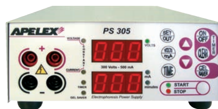
PS 305 Cat. No. 170000