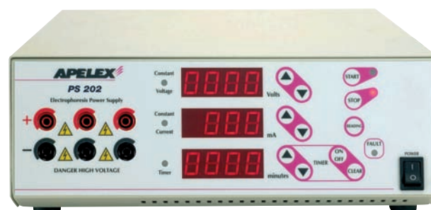
PS 202 Cat. No. 176000 or PS 608 Cat. No. 173000